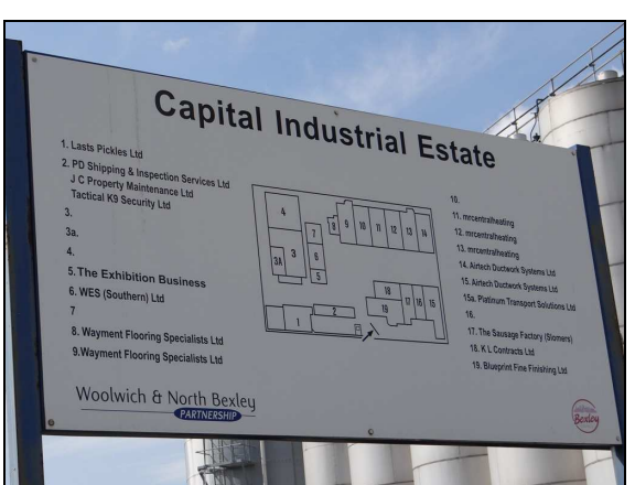
Unit 18 - External View/Parking