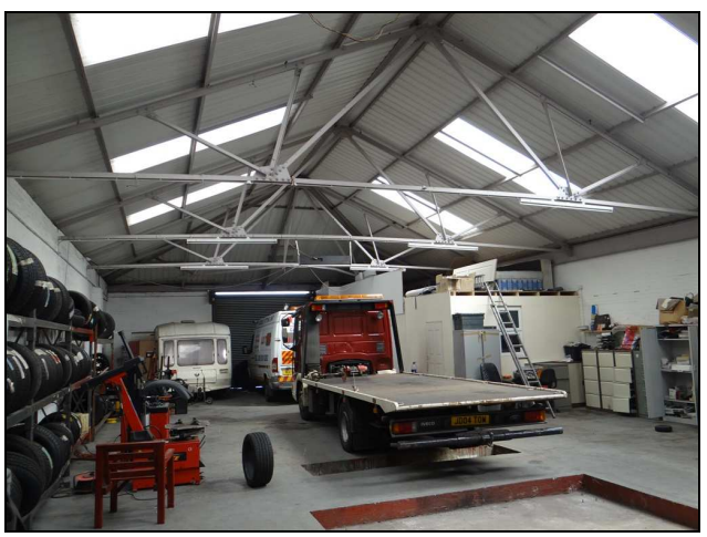
Unit 18 - Internal View